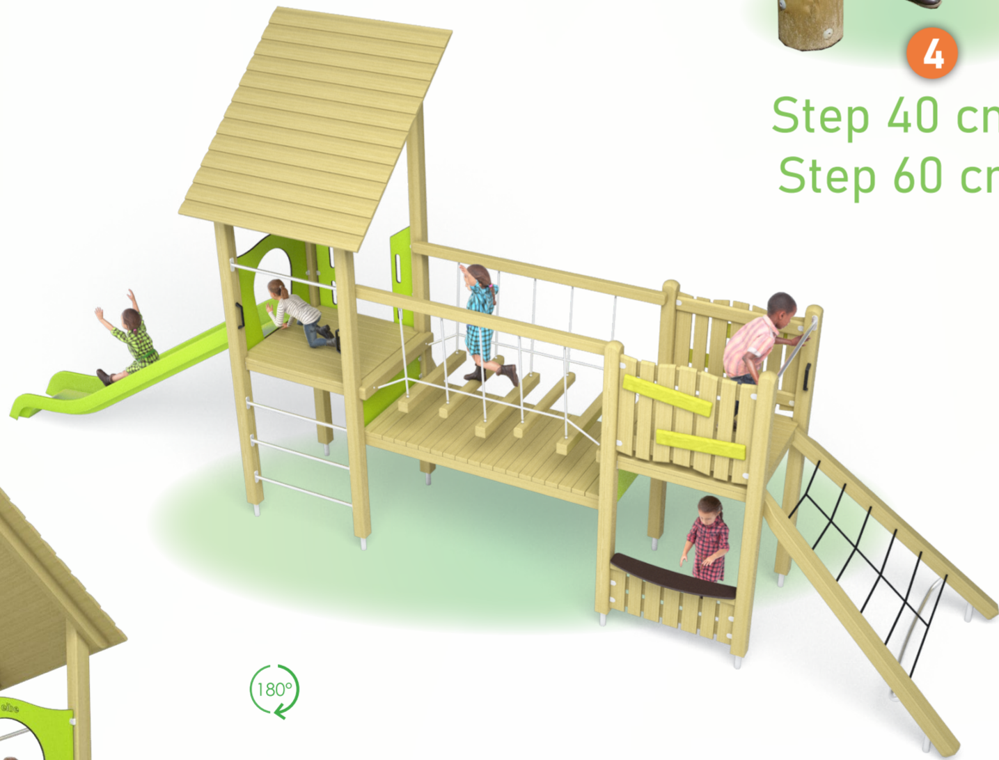
7 Speeltoestel MANASLU