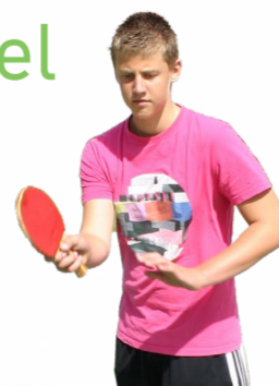
8 Tafeltennistafel FREILAND